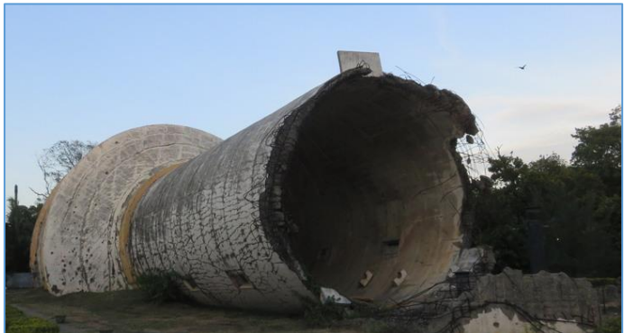
A fallen water tower in Kilinochchi bombed by Tigers during the final phase of the war.

The Tigers next trained their sights on the town of Kilinochchi, which lies just southeast of Elephant Pass, the only land route linking the Jaffna peninsula with the rest of Sri Lanka. In September 1998, the LTTE launched Operation Unceasing Waves II on the Sri Lankan forces' complex at Kilinochchi. After falling to the LTTE, the town would become the showcase and de facto administrative capital of the Tamil Tigers. Here the LTTE demonstrated that it was capable of governance, including civil services such as banks, hospitals, and a judiciary system. 130