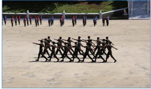
Sri Lankan cadets drill at their military academy at Diyatalawa, located in the central highlands.

The Sri Lankan civil war provides a remarkable, if controversial, example of how the application of overwhelming force was brought to bear to end an insurgency. The United States has spent the last decade and a half at war in the Middle East at a cost of trillions of dollars and thousands of American lives. The vast majority of this time was spent waging a counterinsurgency campaign against Sunni insurgents motivated by a mix of sectarianism and secular resistance to greater foreign occupation, and the fight is still ongoing. In spite of intense pressure from American policymakers, the US military has struggled to defeat insurgencies in Afghanistan and Iraq against various Islamist non-state actors in each. A major part of its effort is to avoid civilian casualties in contexts where fighters and non-combatants are hard to distinguish. By contrast, the SLA applied a deliberate and concerted COIN strategy to use varying degrees of indiscriminate force to isolate the insurgents' elite corps and wipe out the group's will to continue fighting. Moreover, throughout the conflict, the GoSL pursued a parallel and covert counterterrorism strategy of decapitating the LTTE via targeted assassinations of key LTTE leaders (e.g. its Long Range Reconnaissance Patrol unit). 46