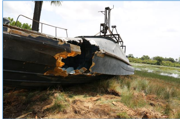
Surveying the wreckage: One of the bombed-out vessels used by LTTE Black Sea Tigers at the PTK Museum outside Mullaitivu, just north of Trincomalee, Sri Lanka.

Initially composed of poor fishermen, the LTTE emerged by 1987 as the most powerful among the disparate Tamil separatist movements, all of which would either be absorbed or destroyed by the Tigers. 35 The intervention by India in the late 1980s on the side of the Tamil Tigers radicalized some of the Sinhalese majority population and at the same time internationalized the conflict.