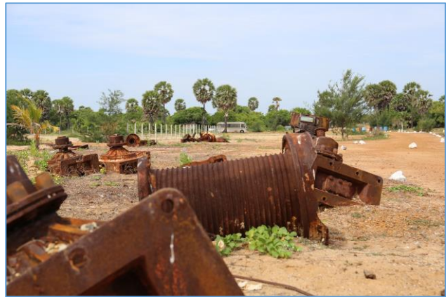
Wreckage of war equipment used by Tamil Tigers at Mullaitivu, the site of the final phase of the counterinsurgency in early 2009.

The Sri Lankan civil war (1983–2009) is one of the rare examples in modern history where a government fought and decisively defeated an insurgency. 1 The war spanned several decades and persisted despite numerous failed ceasefires, outside interventions, and even a devastating tsunami in 2004–2005. The aim of this report is to understand the dynamics of a modern counterinsurgency that “worked.” To carry out this task, in July 2016 a small team of West Point faculty and cadets toured the major battlefields of the northern Tamil-majority regions of this teardrop-shaped island off India’s southeast coast. The team interviewed dozens of military leaders, Tamil opposition figures, activists, journalists, and victims of the conflict. While there are aspects to its counterinsurgency that are unique to Sri Lanka, the assessment in these pages is meant to inform US counterinsurgency (COIN) doctrine in the modern era.